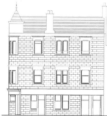
South Elevation 0m 2m 5m 10m