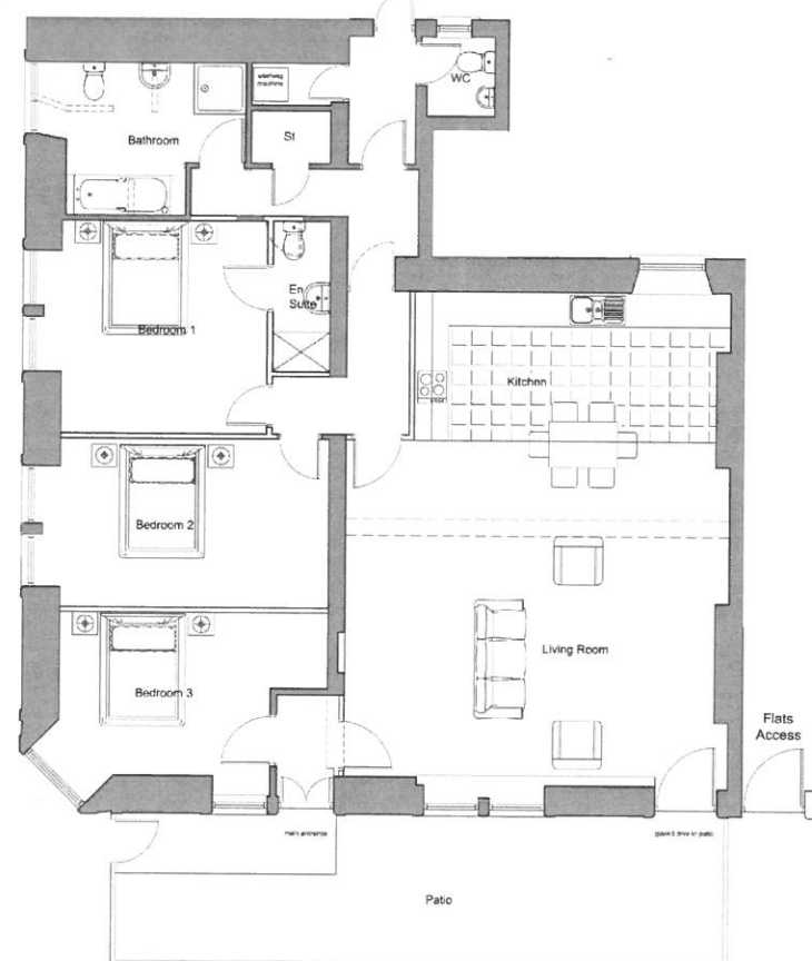
Ground Floor Plan proposed 0m 1m 2.5m 5m