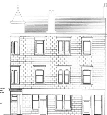
South Elevation 0m 2m 5m 10m