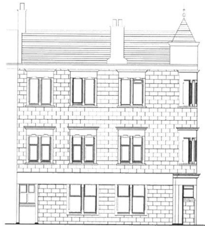
West Elevation proposed 0m 2m 5m 10m