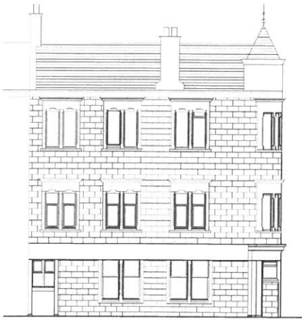
West Elevation existing 0m 2m 5m 10m